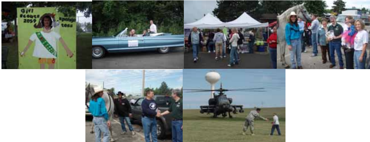
-Fall Festival 2007-