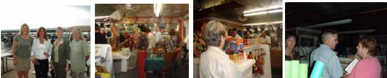
Jayhawk Marina -Joint Networking Event with Paola Chamber of Commerce (Networking in the dark!)