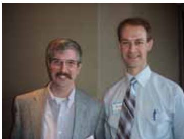
First Friday Donuts- Spring Hill Family Medicine and Young Orthodontics- March 2, 2007