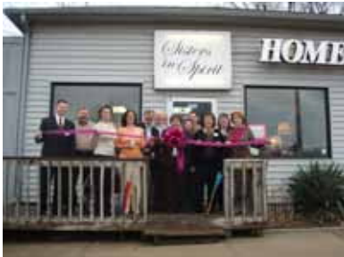
Sisters in Spirit- Grand Reopening and Ribbon Cutting March 9, 2007